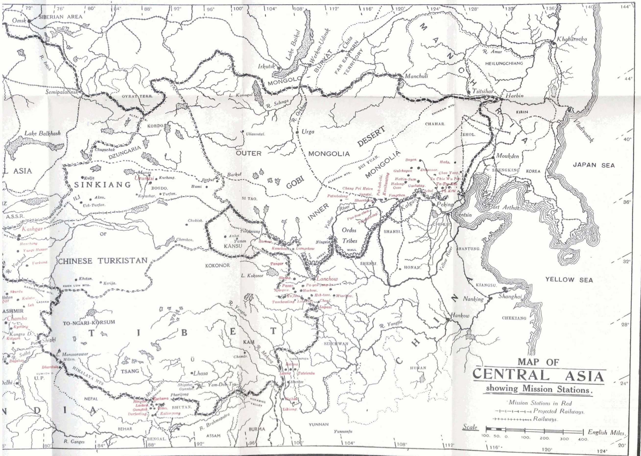
MAP OF CENTRAL ASIA showing Mission Stations.